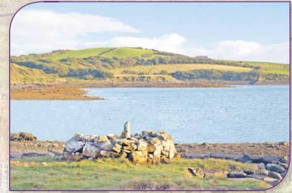
St. Brendan's Well

5 Carrickahowley Castle was built in the mid 16th century and was originally called "Carraig a' Chabhlaigh" or "Rock of the Fleet". It was home to Grace O'Malley (Granuaile) the renowned pirate queen and chieftain of the O'Malley clan in the 16th century. It was from here that the pirate queen of the west set out on many of her expeditions.